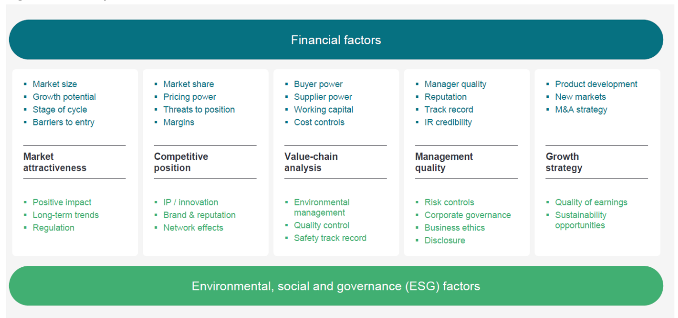
Figure 2: Quality assessment framework

The precise set of ESG issues considered for each company is heavily based on a materiality assessment. This is based on the guidance of the Sustainability Accounting Standards Board as well as other relevant frameworks<sup>3</sup>. So for example, a manufacturing business is likely to be assessed across a wider range of environmental criteria (energy and water use, waste intensity metrics, hazardous chemicals etc.) whereas software businesses will be assessed on criteria that are more weighted to employee-related issues. All businesses will be assessed on corporate governance issues as well as on how the governance of sustainability is organised and incentivised across the organisation. The company's track-record on business ethics is also a key question that is considered for every company.